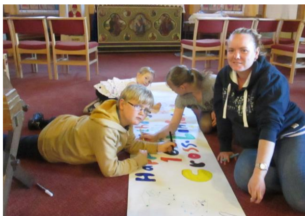
Messy Church at St Nicholas church (above/below)

St Nicholas church also fulfils the function of parish centre either utilising the shared crèche room space or the main church area which has moveable chairs.