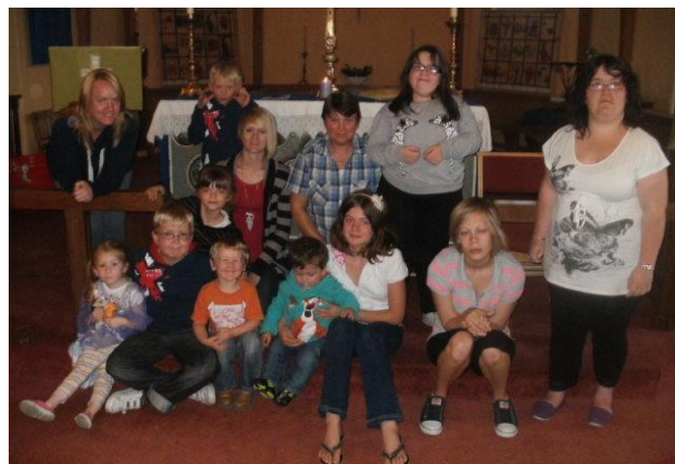
Decorating at St Andrews church for Harvest (below)